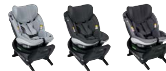
Peak Mesh Anthracite Mesh Metallic Mélange